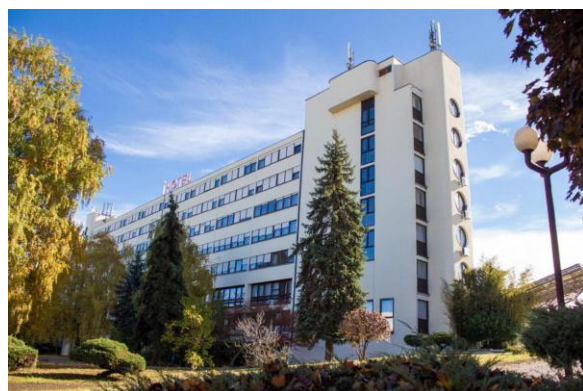
OFFICIAL HOTEL OF TOURNAMENT

All competitors at the weight control must be correct for categories in which they are registered, otherwise they will be immediately disqualified from Zagreb open.